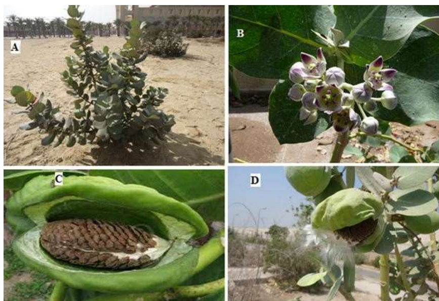
Fig. 1. Calotropis procera grows in monospecific stand, b open flowers, c dehiscent fruit showing dark brown seeds and d dispersal of seeds with white silky pappus