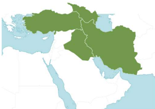
Fig. 2. Global distribution of Achillea vermicularis in the world - green is a sign of nativeness.

The height of this plant is 20 to 50 cm. The stem of this plant is several and branched from the base or is rarely simple. Flowering is late spring to mid-