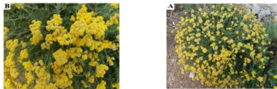
Fig.1. Achillea vermicularis Trin A: vegetative herbage before fullbloom B: Full bloom